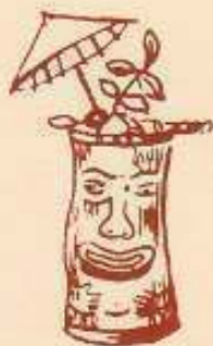
MAI TAI .....