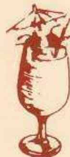
LOVER'S GOLD CUP .....

Honolulu's favorite libation rums replace the oloebau and a gardenia lends enchantment.