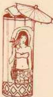
PLANTER'S PUNCH .....

It is the most famous drink of the Islands. Guaranteed to bring you a smile