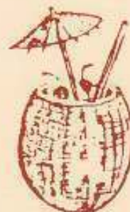
BLUE HAWAIIAN .....

Rum and blue curacao and the mixed juice.