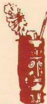
PINA COLADA .....

It is the most famous drink of the Islands. Guaranteed to bring you a smile